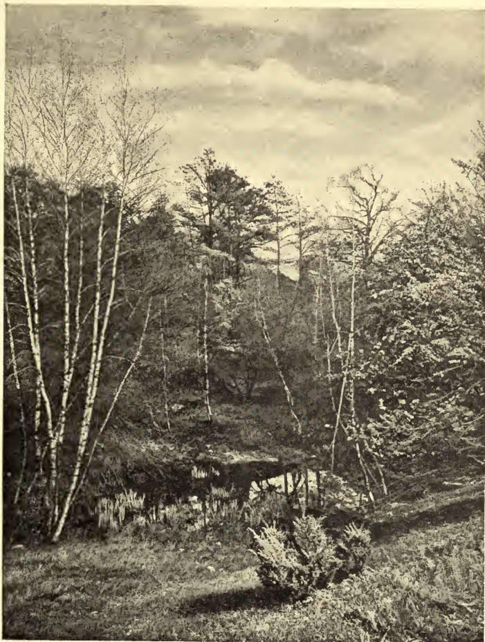
GLEAMS NOW AND THEN A POOL SO SMOOTH AND CLEAR